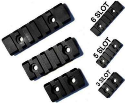
MLOK-R 3/5/6 Mlok rail sections 3Slots 5Slots 6Slots.