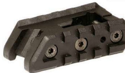
TPR-15P M4/AR15 front sight side by side light or laser mount.