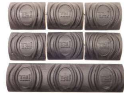
PCK-S Rubberized rail cover set.