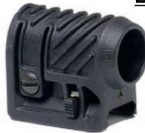
BK1 Laser mount for picatinny rails.