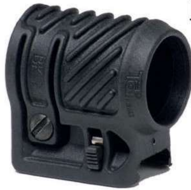
BK2 1 Inch light mount for picatinny rails.