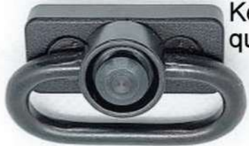
QDK Keymod mounted quick detach socket.