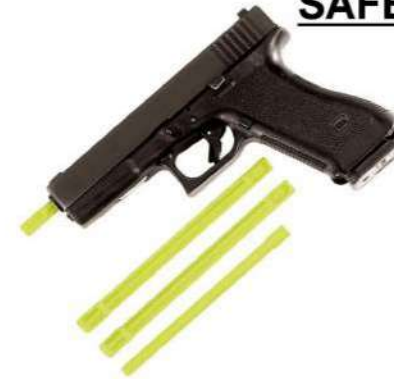
SAFETY STIX Chamber clear training flag.