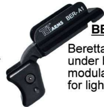
BER-A1 Beretta 92 under barrel modular rail for lights.