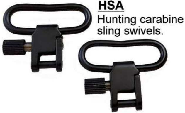
HSA Hunting carabine sling swivels.